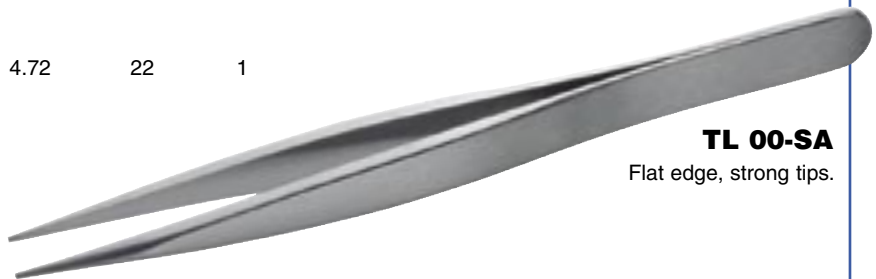
TL 00-SA Flat edge, strong tips.