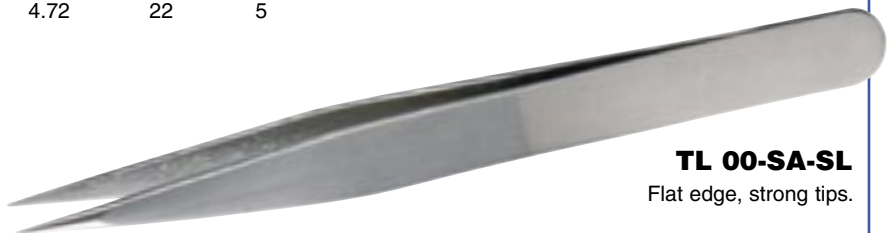
TL 00-SA-SL Flat edge, strong tips.