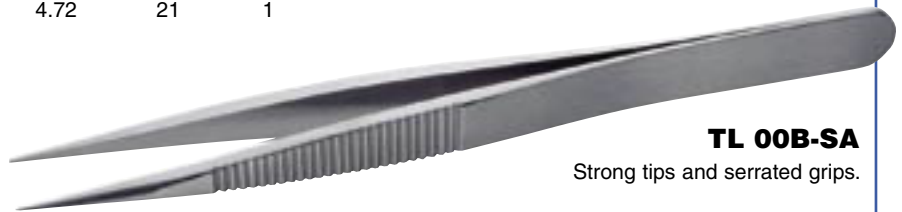
TL 00B-SA Strong tips and serrated grips.