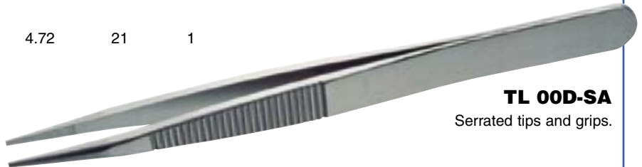
TL 00D-SA Serrated tips and grips.