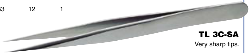
TL 3C-SA Very sharp tips.