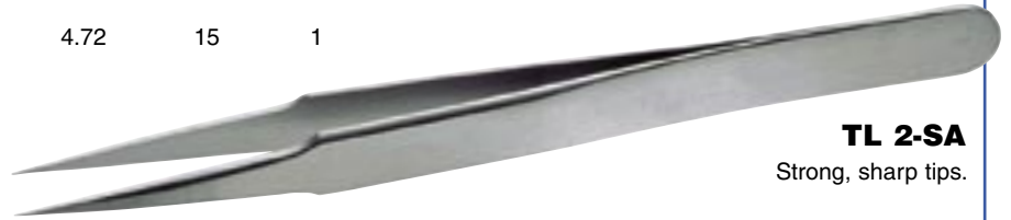
TL 2-SA Strong, sharp tips.