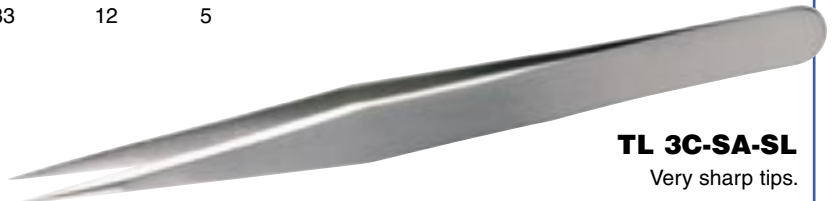
TL 3C-SA-SL Very sharp tips.