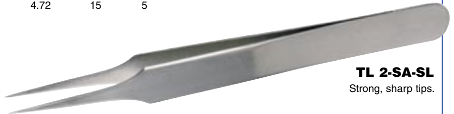
TL 2-SA-SL Strong, sharp tips.