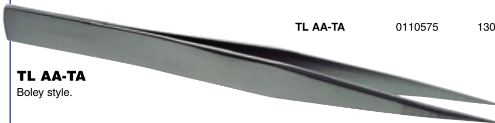
TL AA-TA Boley style.