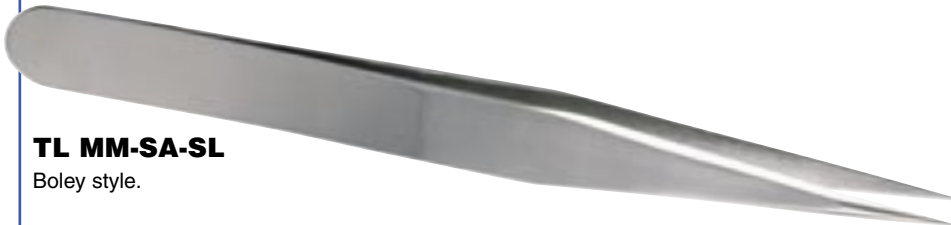
TL MM-SA-SL Boley style.