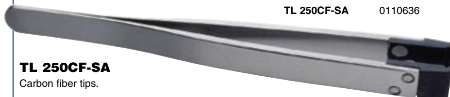
TL 250CF-SA Carbon fiber tips.