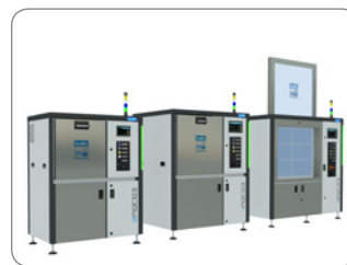
AQUBE® M two-tank systems

A closed rinsing circuit is integrated into all kolb cleaning systems. Usually these are systems for product (PCBs, DCBs, HDIs, etc.) or for tool cleaning (screens, stencils, solder frames / carriers, condensate filters, etc.). The rinsing water is repeatedly used in the ClosedLoop process (depending on the cycle number and the task options) until its dirt entry respectively its \mu\text{S} conductance is so high that it is no longer usable and has to be disposed. The cheapest disposal is the indirect introduction into the public sewage network. This may only be done with regard to the legal limit values! The operator is responsible for compliance with the local regulations, possible authorizations by the authorities and proper operation.