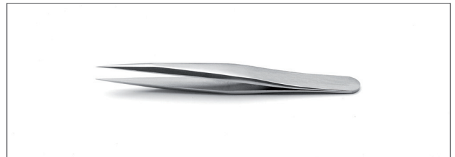
M3-SA 2 3/4" 70 mm Sharp, fine tips