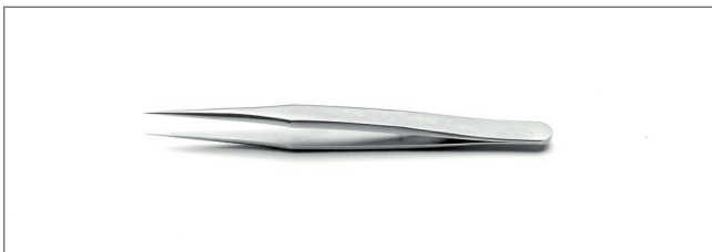
M4-SA 3" 80 mm Very fine tips