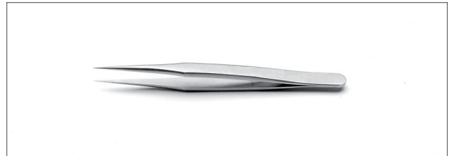
M2-SA 3" 80 mm Flat sharp fine tips