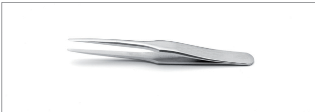
M2A-SA 2 3/4" 70 mm Rounded flat tips